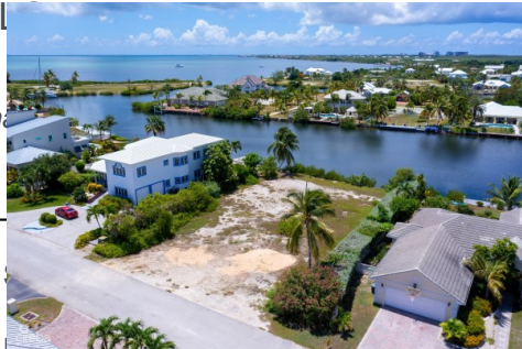
Depth: 135 Acres: 0.351