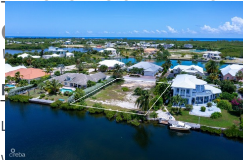
Width: 100 Parcel: 446