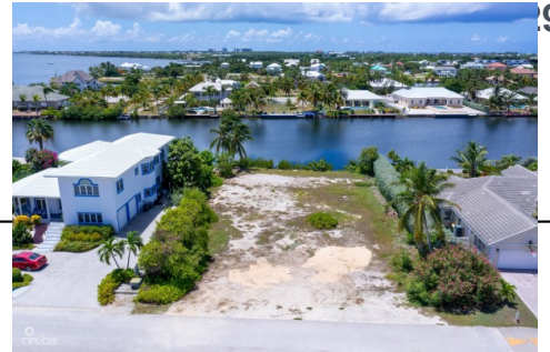
Block: 5A Area: 10