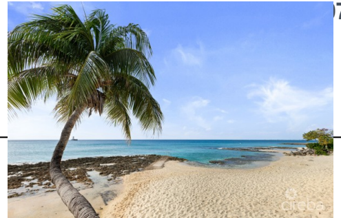
Square Feet: 1,220 Parcel: 103H16