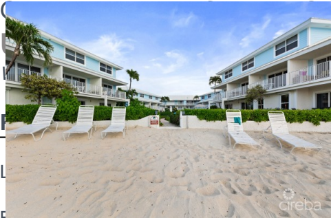
Beach: 2 Year Built: 1981 Area: 25