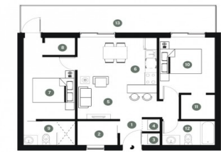
PEARL - 2 + DEN