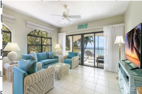
Beeds: 2 Year Built: 1989 Area: 25