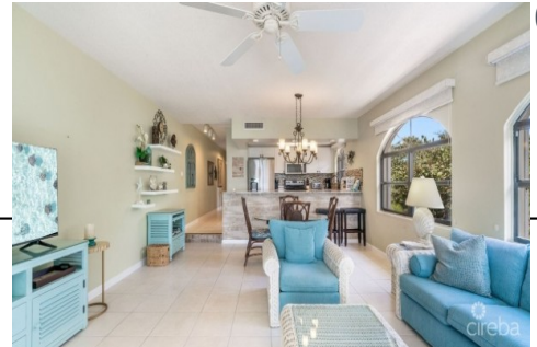
Square Feet: 1,384 Parcel: 8H7