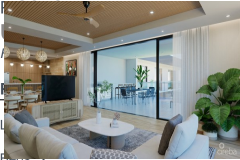
Beats: 3 Year Built: 2025 Area: 75