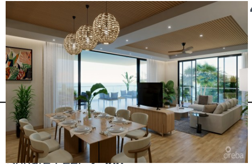
Square Feet: 2,368 Parcel: 21UNIT404