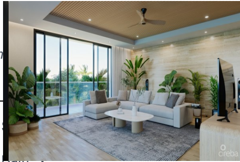
Bath: 3 Block: 64A