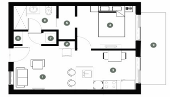
RUBY - 1 BED