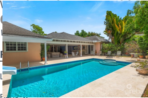
Beach: 6 Year Built: 1991 Acres: 1.09