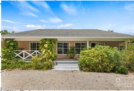
Bath: 4.5 Block: 15B Area: 30