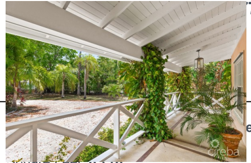
Square Feet: 6,710 Parcel: 267