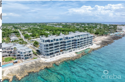
Beds: 3 Year Built: 2021 Area: 30