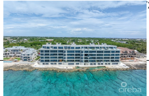
Square Feet: 3,450 Parcel: 786H21