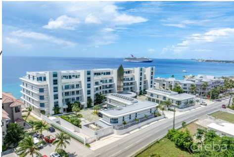
Bath: 4.5 Block: 14E