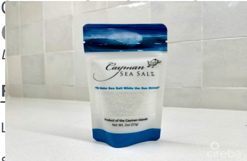
Square Feet: 1 Area: 50