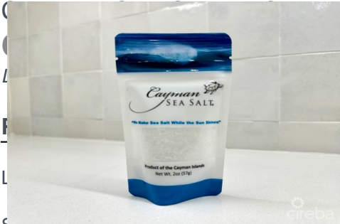
Square Feet: 1 Area: 50