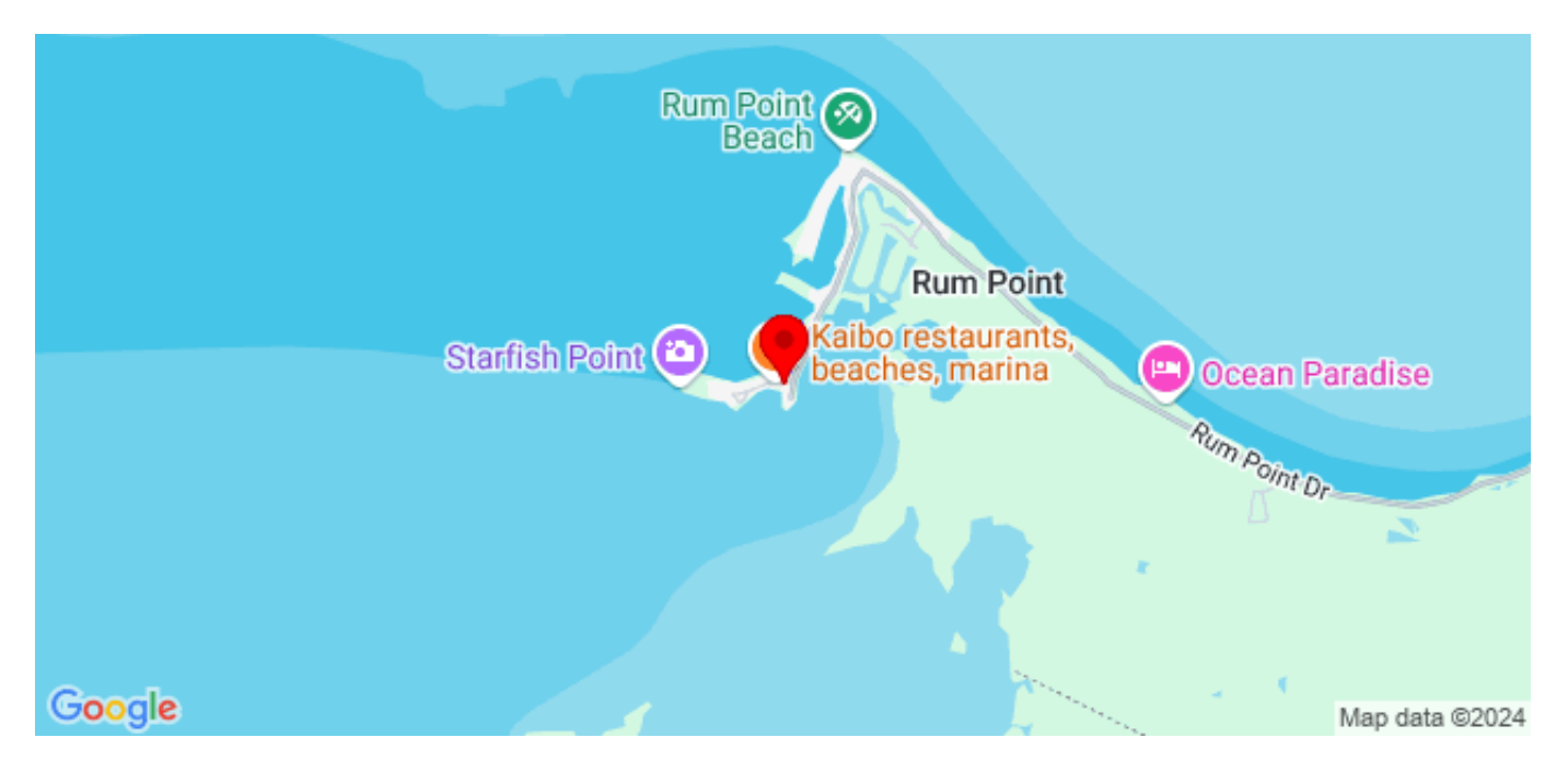
CIREBA MLS LDX feed courtesy of BERKSHIRE HATHAWAY HOMESERVICES CAYMAN ISLANDS

*Disclaimer: The information contained herein has been furnished by the owner(s) and or their nominee and represented by them to be accurate. The listing company, agent and CIREBA MLS disclaims any liability or responsibility for any inaccuracies, errors or omissions in the represented information. The listing details herein are also courtesy of CIREBA (Cayman Islands Real Estate Brokers Association) MLS and/or via LDX (Listing Data Exchange) feed. All the information contained herein is subject to errors, omissions, price changes, prior sale or withdrawal, without notice and is at all times subject to verification by the purchaser(s).