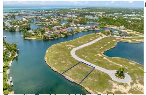
Density Residential (For Sale) Block: 22E