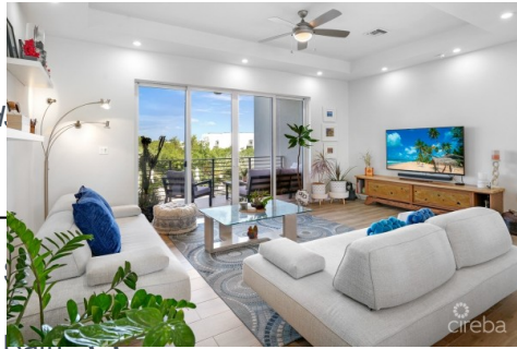
Bath: 5.5 Block: 22E