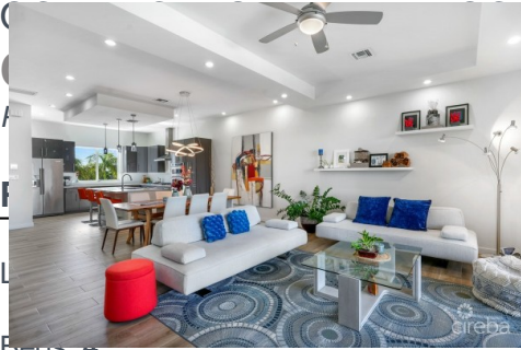
Beds: 4 Year Built: 2018 Area: 40