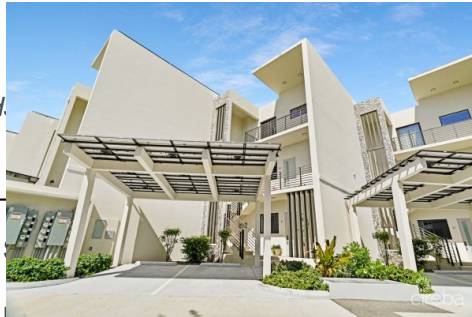
Bath: 2 Block: 22E