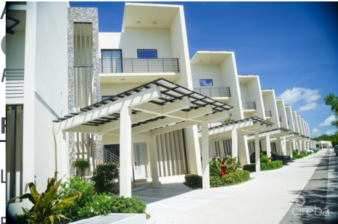
Beeds: 2 Year Built: 2022 Area: 40