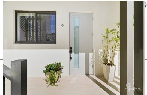
Square Feet: 1,271 Parcel: 527V1H9