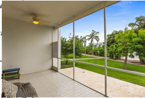
Bath: 4.5 Block: 21B