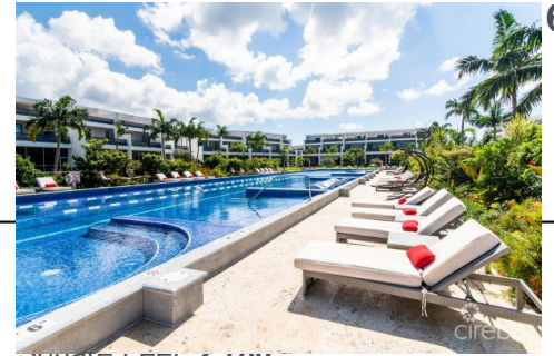
Square Feet: 2,700 Parcel: 122H25