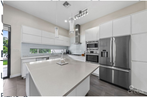
Beds: 4 Year Built: 2017 Area: 30