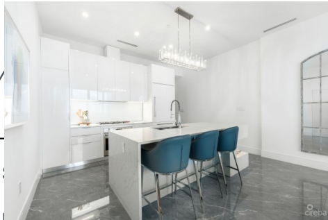
Bath: 3 Block: 14E