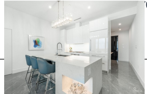
Square Feet: 1,500 Parcel: 786H8