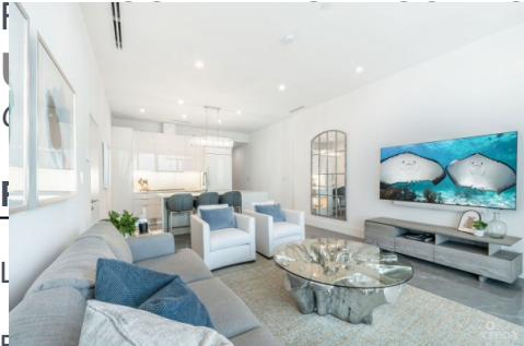
Bed: 3 Year Built: 2021 Area: 30