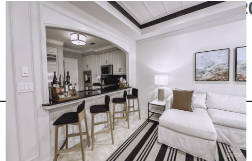
Square Feet: 2,365 Parcel: 451/3H1H1