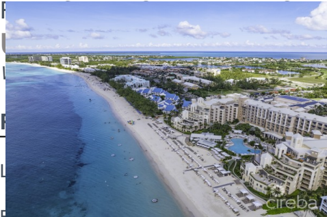
Beeds: 2 Year Built: 2005 Area: 25