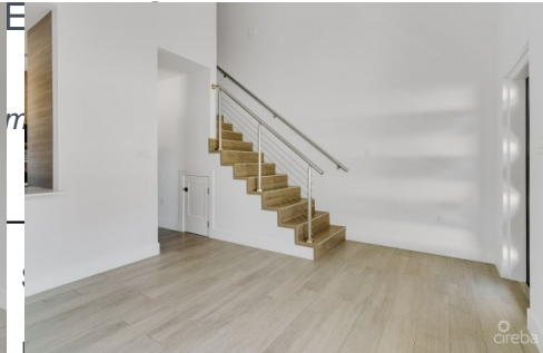
Bath: 2.5 Block: 4C