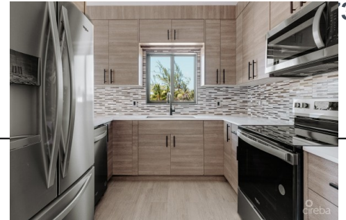
Square Feet: 1,200 Parcel: 572H2