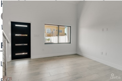
Beeds: 2 Year Built: 2025 Area: 10