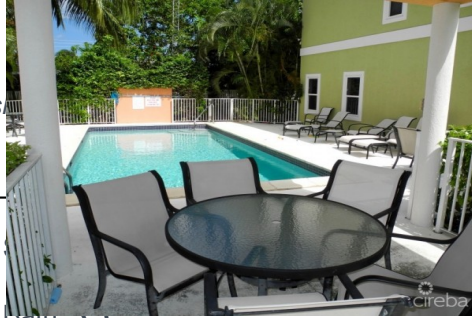
Bath: 3.5 Block: 15C