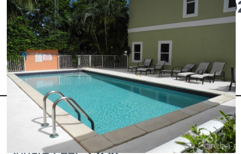
Square Feet: 1,850 Parcel: 342H10