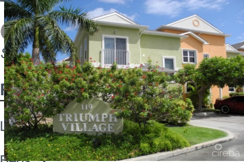
119 TRIUMPH VILLAGE Beds: 3 Year Built: 2007 Area: 30